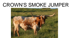
J5 BELLA' BELLA'