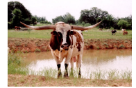
Field Of Pearls