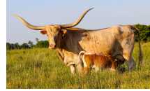
RUTLEDGE'S MELLOW YELLOW